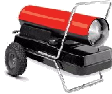
“Torpedo”-style Forced-Air Heater

“ What if you could purchase a superior heater that, in it's FIRST year, ended up saving you money? ”